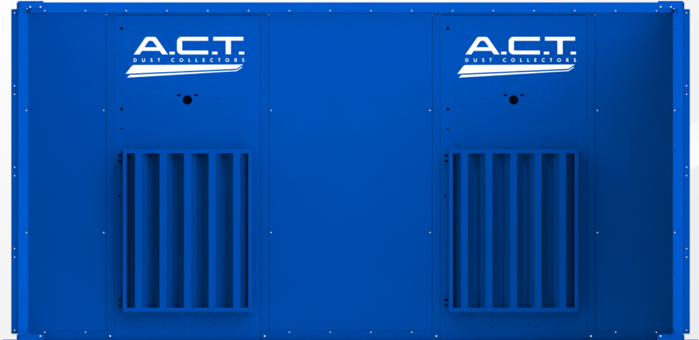
ACTION Booth Double

The ACTION Booth's multifunction design can meet your workspace requirements.